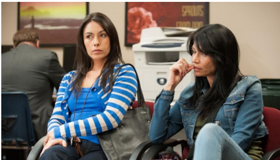
Blackstone was nominated for five 2014 Canadian Screen Awards on Monday. (Prairie Dog Film and Television)

CBC News Posted: Jan 15, 2014 6:00 AM MT | Last Updated: Jan 14, 2014 9:11 PM MT